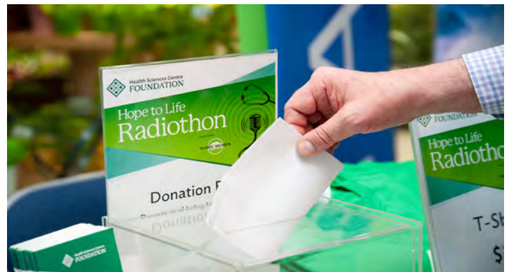
Generous supporters donating to the 2019 Hope to Life Radiothon.

To give today, please visit www.hscfoundation.mb.ca ; otherwise, tune in, pick up your phone, and give from the heart on January 24.