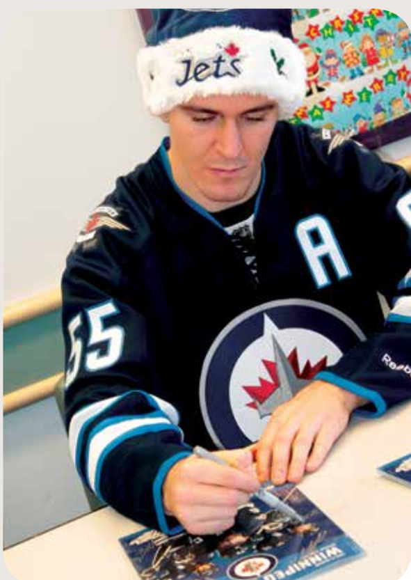
Winnipeg Jets Captain Mark Scheifele